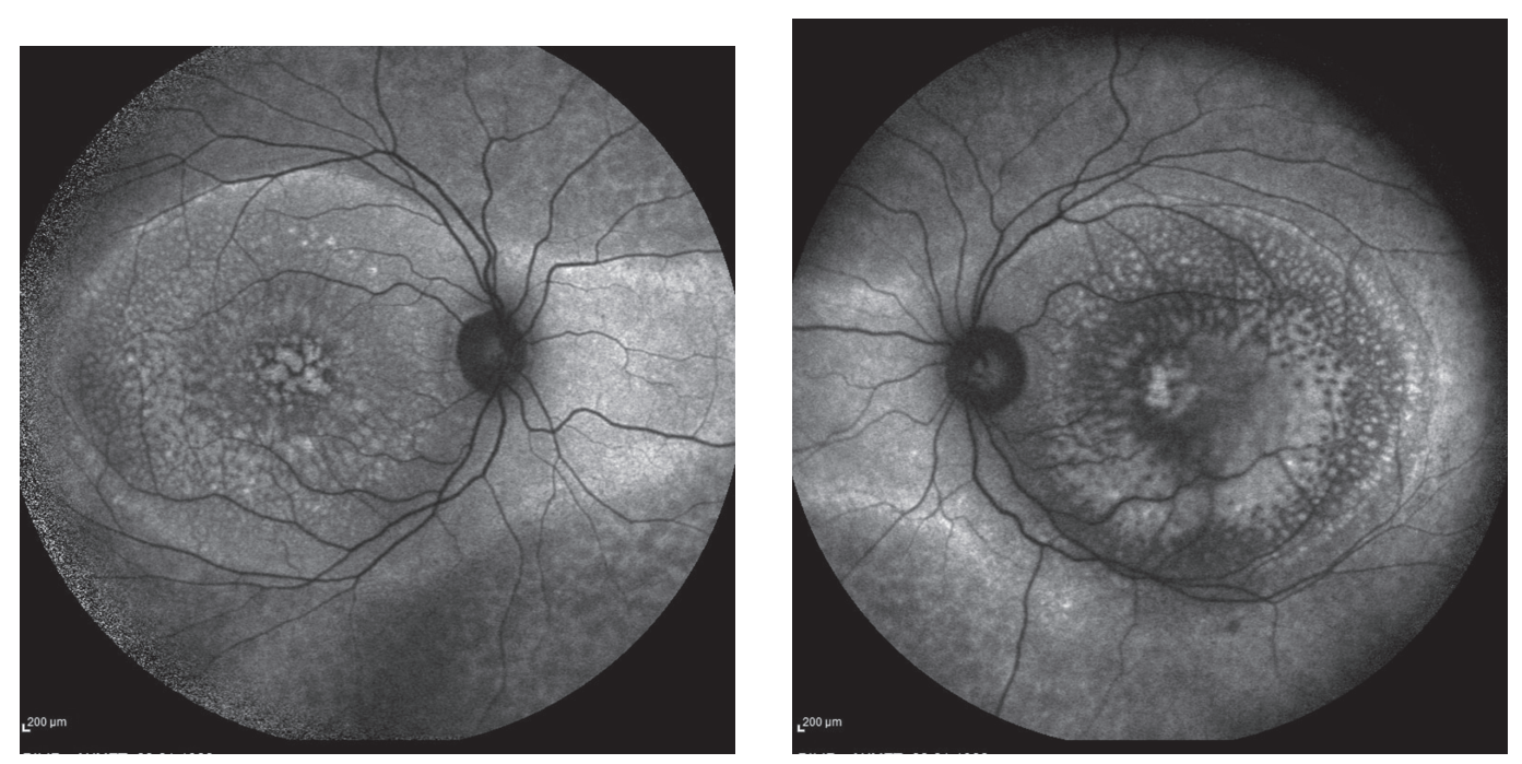
Figure 3 a-b: Fundus autofluorescence images show hyperautofluorescent spots around the macula and nasal of the optic disc.