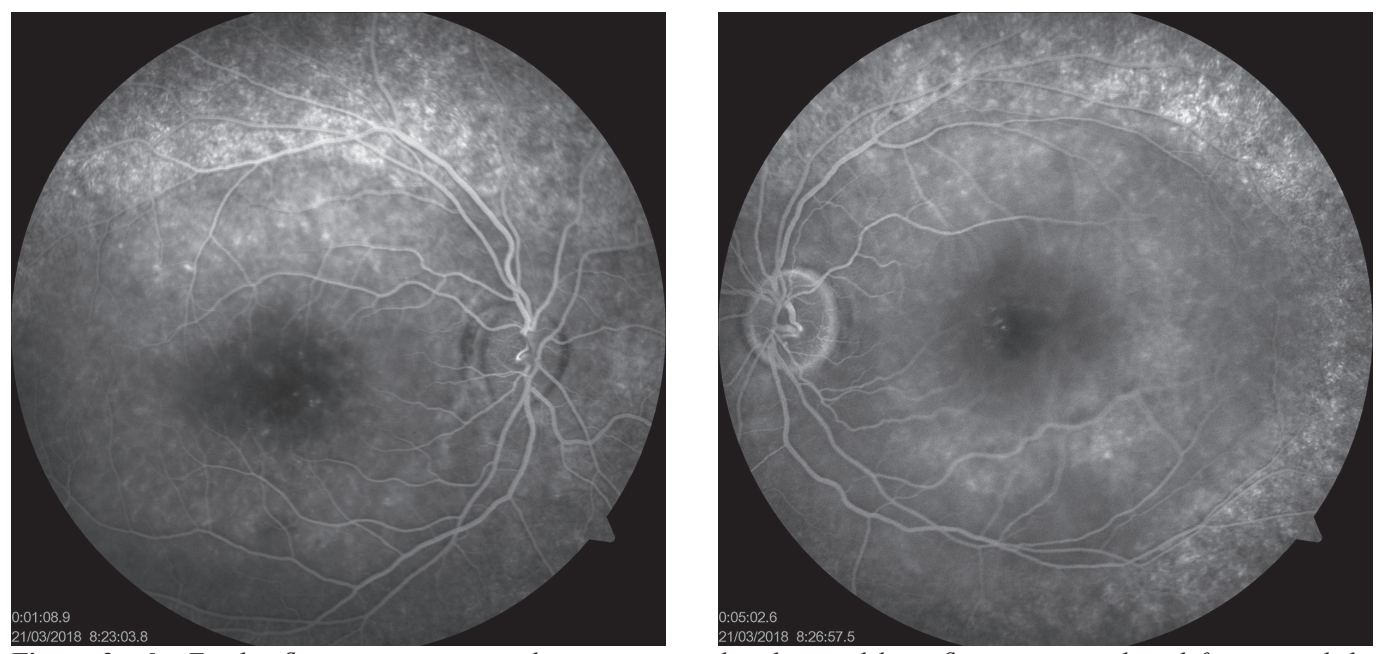
Figure 2 a-b: Fundus fluorescein angiography images reveal widespread hyperfluorescent window defect around the arcades, but no dye leakage in the fovea.

Goldmann-Favre syndrome is an autosomal recessive retinal degeneration caused by mutations in the nuclear