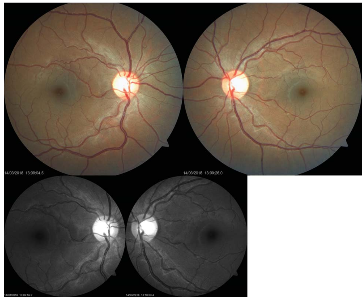
Figure 2: Colored fundus photography and fundus autofluorescence images showed the temporal paleness of both optic nerves and mild venous tortuosity in retinal vessels.