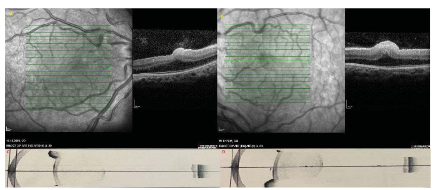
Figure 2. Posterior segment OCT scan shows papillomacular folds with the SPECTRALIS®OCT (Heidelberg Engineering) A: right eye B: left eye; and full length longitudinal cut with the Zeiss IOLMaster®700.