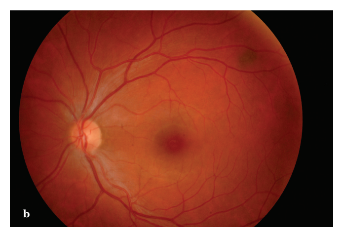
Figure 1a,b: Fundus examination of the right eye revealed papilledema with peripapillary nerve fiber layer hemorrhage (a). Fundus examination of the left eye showed a remarkable crowded disc (b).

On the 4 months follow up, he had a scotoma in the temporal visual field, although his complaints were minimal. He has not taken the drug since his complaint started. BCVA were 10/10 in both eyes. In the right eye, defective color vision and relative afferent pupillary defect were still present.