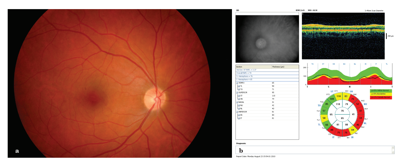
Figure 3a,b: After 4 months, fundus examination of the right eye: papilledema and peripapillary nerve fiber layer hemorrhage disappeared but optic disc was pale and crowded. (a). After 4 months, peripapillary thickness of the right eye showed significant thinning. (b).

Ret-Vit 2014;22:149-152 Üçgül Atılgan et al. 151